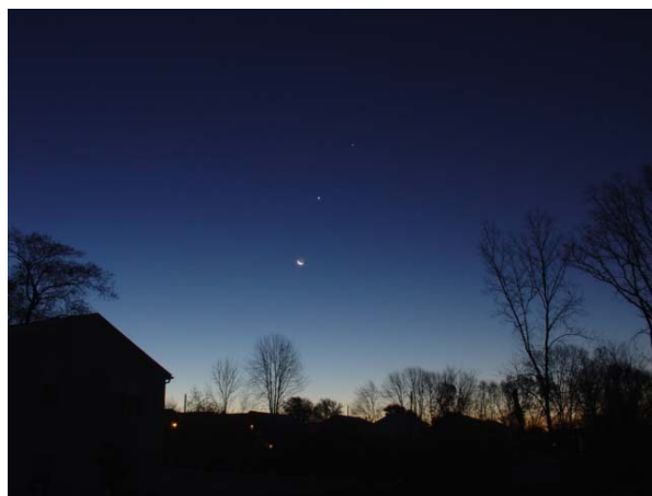
The Moon, Venus & Jupiter in the morning sky, November 10, 2004.