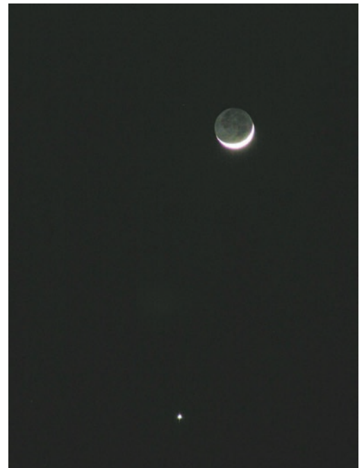
Left: Venus & Mercury over the Mt. Hope Bridge, February 4. Right: Moon & Venus, February 19, Minolta Z1, ISO 400 4/10's of a second f/3.2.