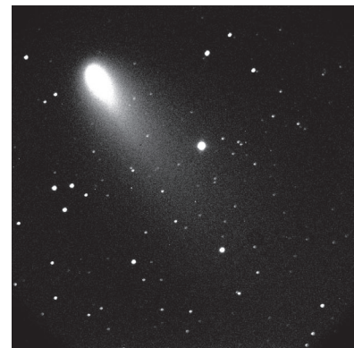
Photos of Comet 73P Schwassman-Wachmann 3.