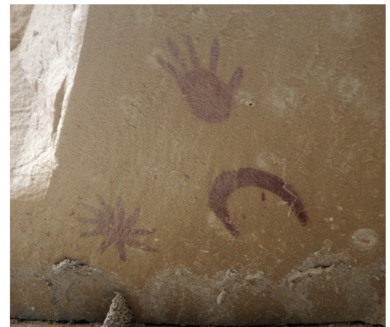
During the visit to Chaco Canyon, New Mexico, several intrepid Skyscrapers made the 7+ mile round trip hike to the supernova petroglyph, depicting the 1054 Crab supernova.