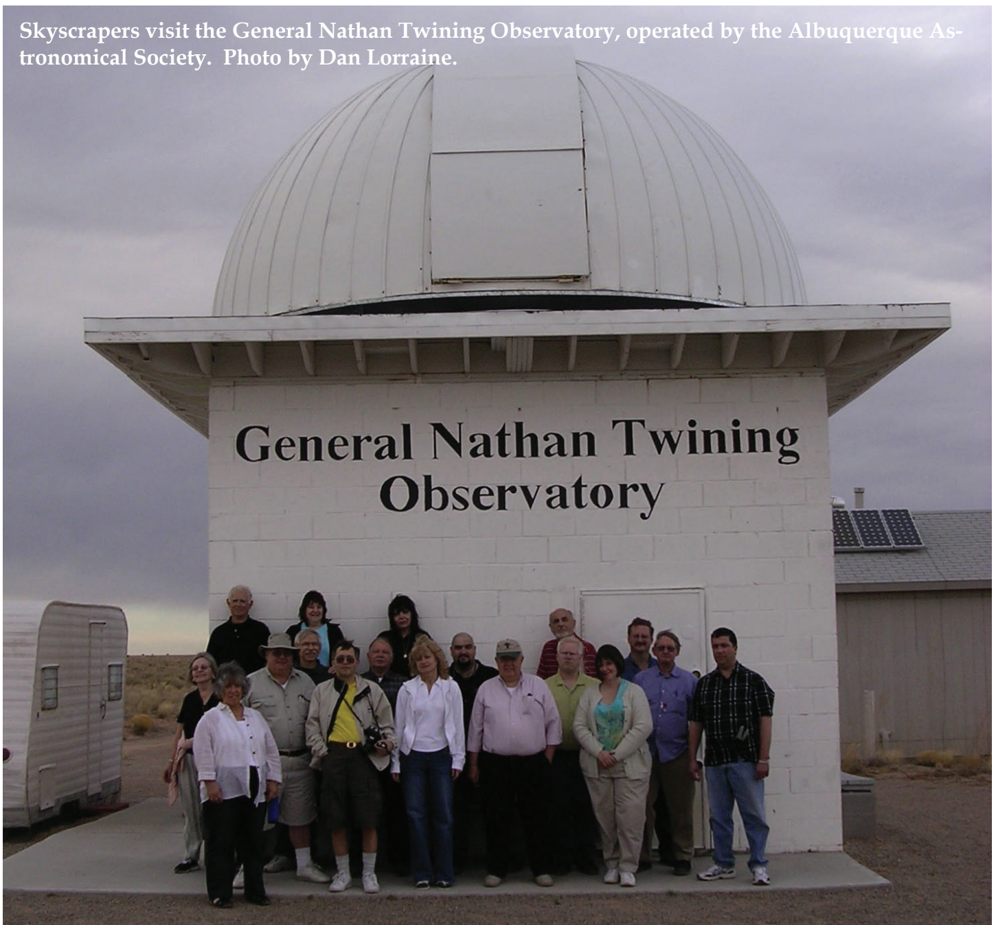
Skyscrapers visit the General Nathan Twining Observatory, operated by the Albuquerque Astronomical Society.

New NMP missions fly every year and one-half to two years, taking tomorrow’s space technology for a daredevil test drive.