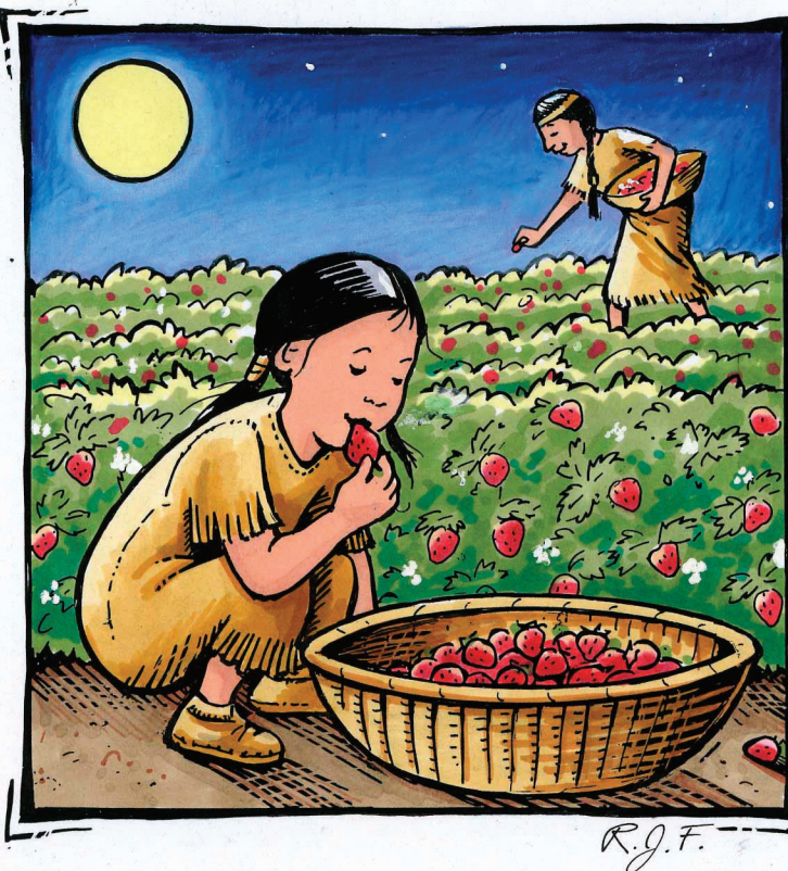
Artwork by Ruth Flanigan

Should you have a telescope you can train on Mercury you will notice that the planet is 39% illuminated, like a waxing crescent Moon just before First Quarter. If you begin observing Mercury earlier in the month you can watch him quickly go through