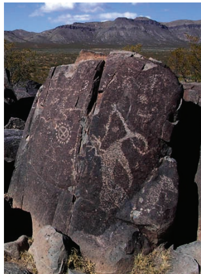
Left: Inside the "Big Room" at Carlsbad Caverns. Photo by Tom Barbish. Right: Three Rivers Petroglyph site. Photo by Dan Lorraine. Below: Acoma Pueblo. Photo by Dan Lorraine.