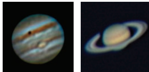
Jupiter & Saturn, 797 & 762 stacked images, Meade 8" LX200 f/6.3, Phillips ToUcam 840K Pro II webcam.

His primary research involves the Epoch of Reionization (EOR) as an emerging area of observational cosmology that focuses on the universe as the first luminous objects appear. The cosmic microwave background (CMB) shows us that the early universe was very, very smooth, while today matter is clumped into galaxies and clusters separated by enormous voids. Dr. Miguel Morales is also a member of the VLA Epoch Reionization Observation team.