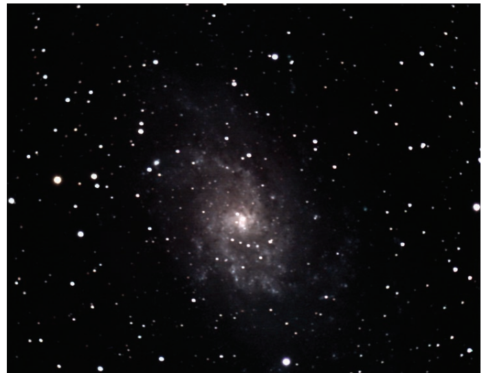
Spiral Galaxy M33 in Triangulum taken from Seagrave Observatory on October 12. DS12 color camera on AT66ED, 1½ hours of 5½ min exposures stacked.

Perseid most important shower. July 15- Aug. 15.