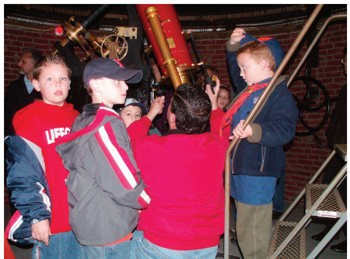
Skyscrapers hosted a large Scout group at Seagrave Observatory on Thursday, October 20.