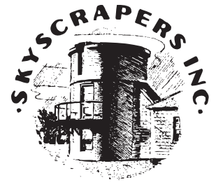
47 Peeptoad Road North Scituate, RI 02857

Take Interstate 295 South (off Interstate 95 in Attleboro.) Exit onto Rt. 6 West in Johnston. Bear right off Rt. 6 onto Rt. 101. Turn right on Rt. 116. Peeptoad Road is the first left off Rt. 116.