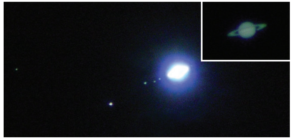
Saturn & moons: Sony DSC-F717, 30 seconds @ f2.4. ISO 400, Orion Shorty Barlow 2X, 40mm EP. 120mm refractor. Camera at maximum zoom, tungsten setting. Satellites from left are: Titan, mag. 8, Rhea, Dione, Tethys, mag. 10, and on the right side of the planet at the 3:00 position, Enceladus, mag. 11.7. Photos taken 03/30/2008., taken 03/30/2008. Inset: Saturn orientation shot: Sony DSC-F717,1/6 second @ f/8, ISO 200. Orion Shorty Barlow 2X, 40mm EP. 120mm refractor. Camera at maximum zoom, tungsten setting, taken 03/30/2008.